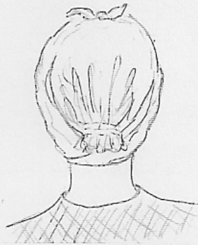
Back Pull up ties and secure with knot on top of head. Tuck tie ends on each side of turban.