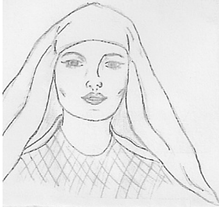
Front Fold edge under at forehead